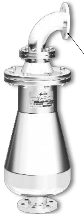
Full bore outlet screwed for DN50 and Flanged for all other sizes

1" backflush port arrangement as standard complete with full bore Ball Valve isolators