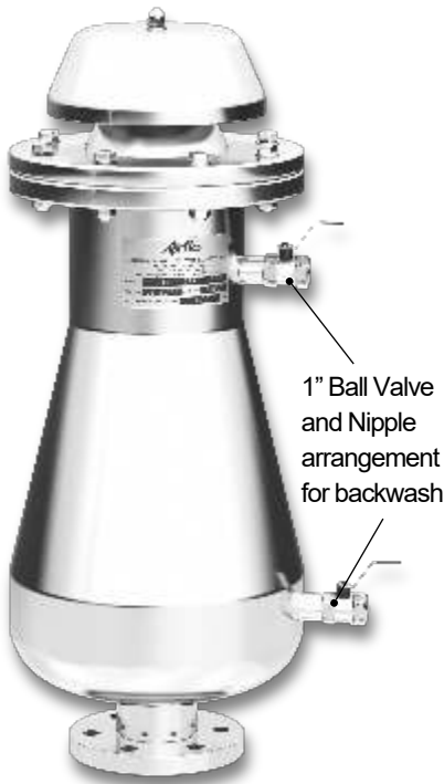
1" Ball Valve and Nipple arrangement for backwash

AIRFLO Variable Orifice Air Valves are available in a variety of outlet configurations as well as with and without backflushing ports. To suit a particular application. Standard options are as follows: