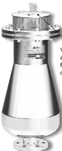
Vacuum Bias arrangement for air intake but not discharge

Vacuum Break Bias arrangement will break vacuum but not discharge air